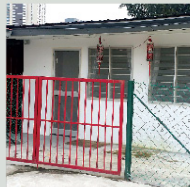
"Rumah Kasih" mosquito netting