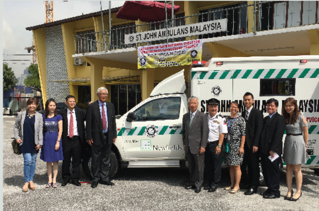
Group photo of all with the sponsored ambulance