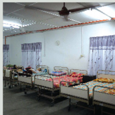
Curtains installation in "Rumah Kasih"