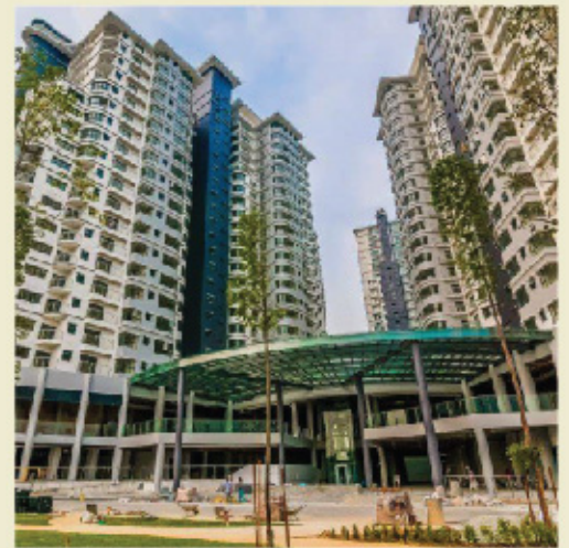
Actual site overall view, May 2016