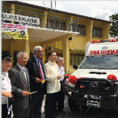
Launching ceremony by VIP guests

As part of our philosophy on giving back to society, Newfields recently sponsored a fully fitted amphibious ambulance during the launch of St. John's Ambulance Malaysia's National Disaster Preparedness Management Project Malaysia on 15 Jan 2016, at St. John's National Headquarters. The guest of honour was YB Datuk Seri Ir. Dr. Wee Ka Siong, Minister in the Prime Minister's Department. We sincerely hope that this project will benefit the people of Malaysia in preparing for future disasters.